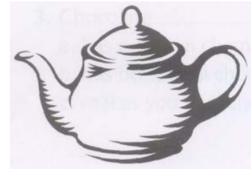
.....for a few minutes.