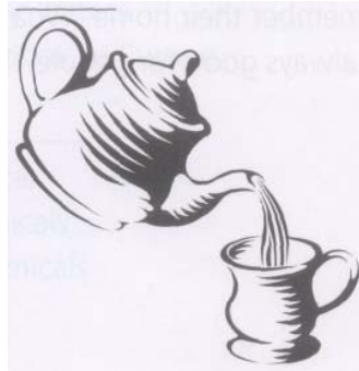
.....the tea into the cup.