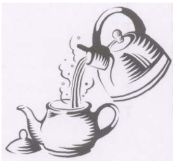
.....the teapot with boiling water.