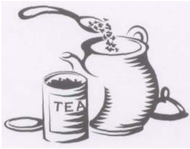
.....some tea into the teapot.